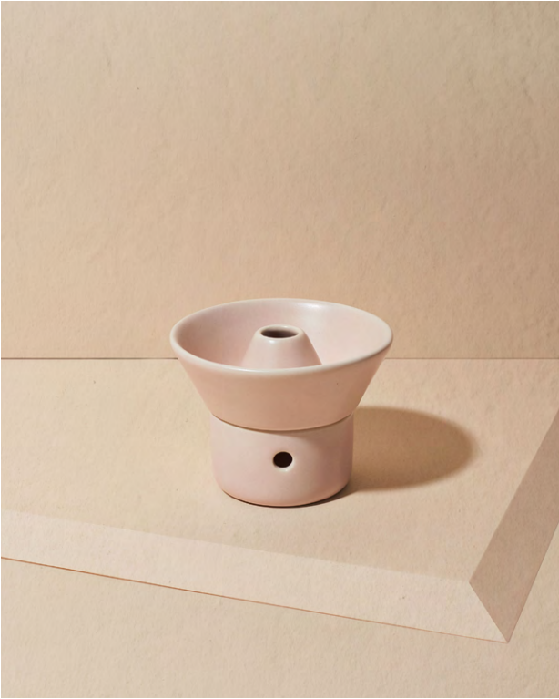
A4b — Blush Pink