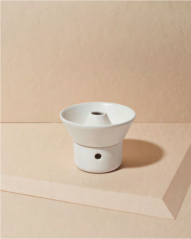
A4a — Almond White