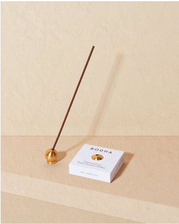
A3a — Polished Brass