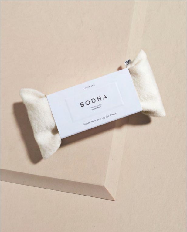
A1f — Cream