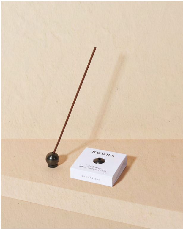
A3b — Black Brass