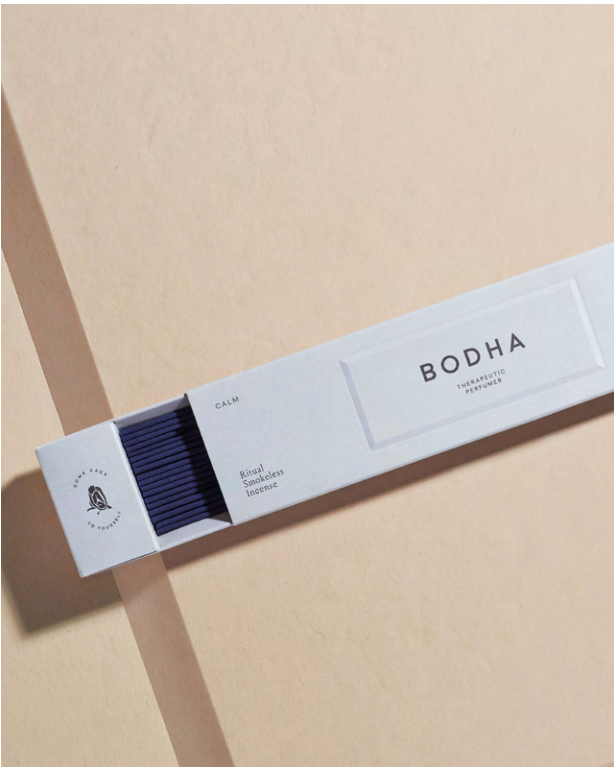
A2c — Calm