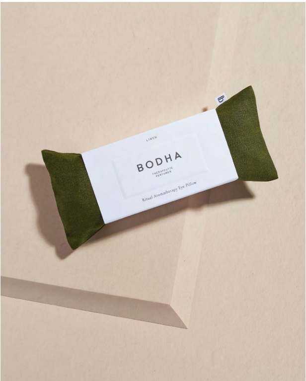
A1e — Emerald