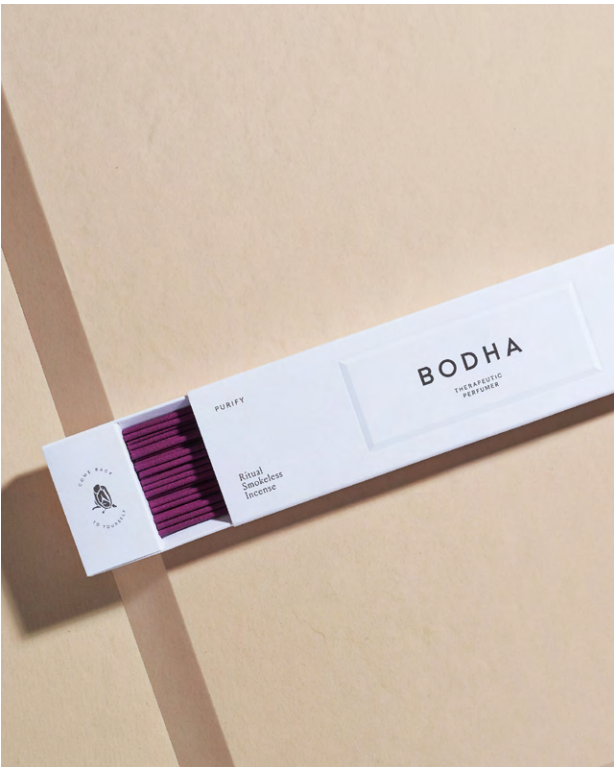
A2d — Purify