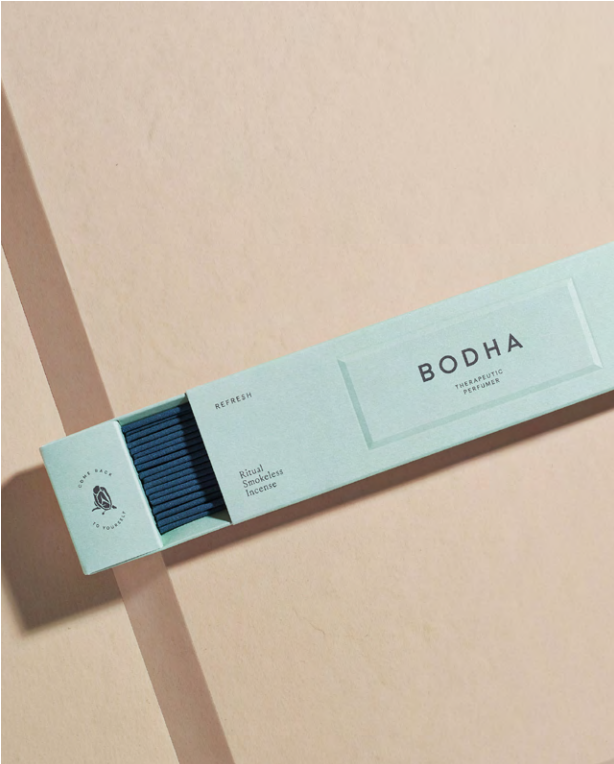
A2a — Refresh