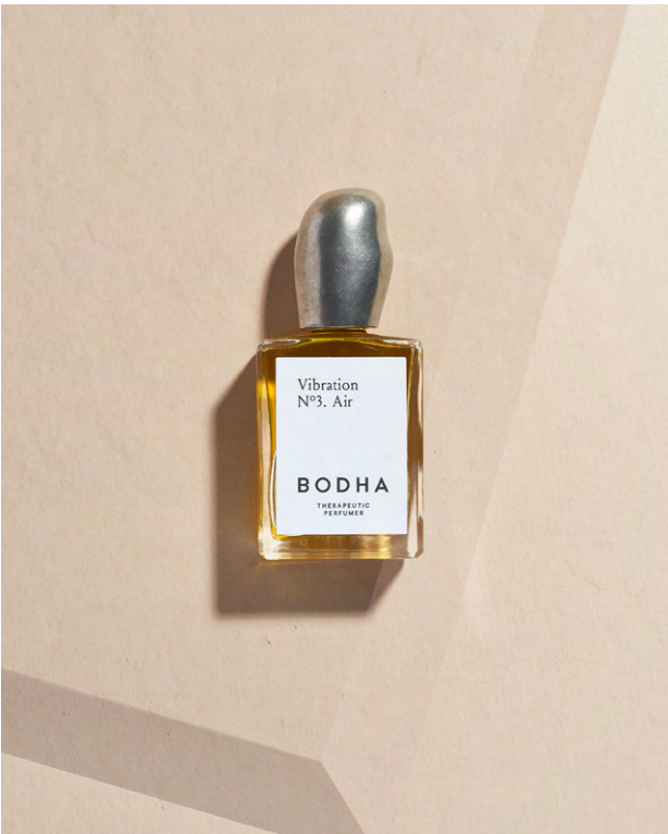
A6c Vibration N°3 Air