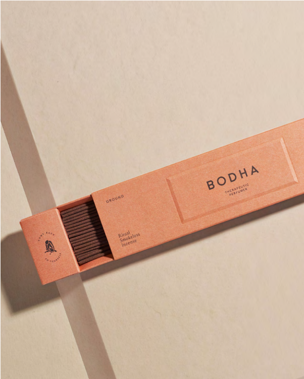
A2b — Ground