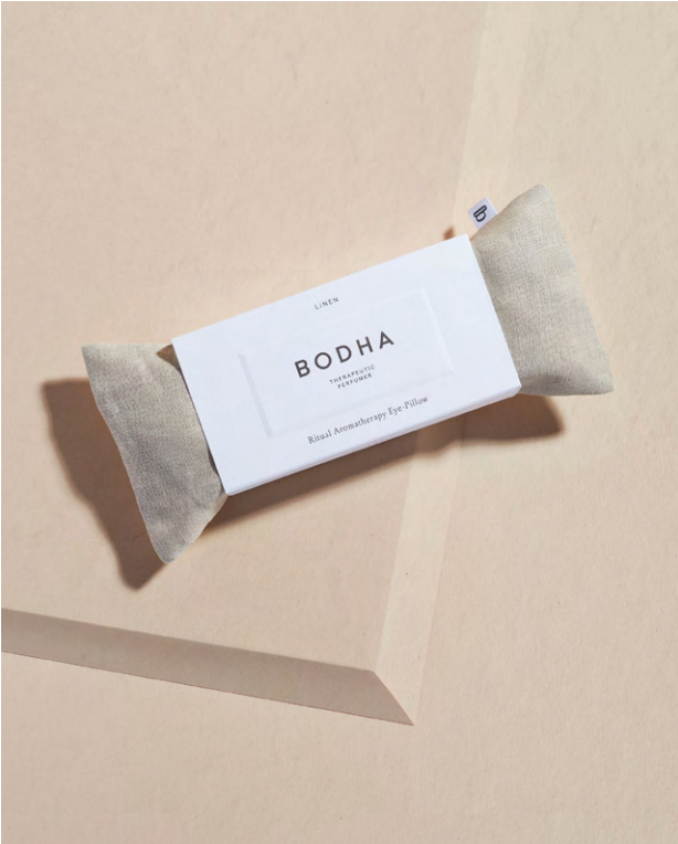
A1a — Natural