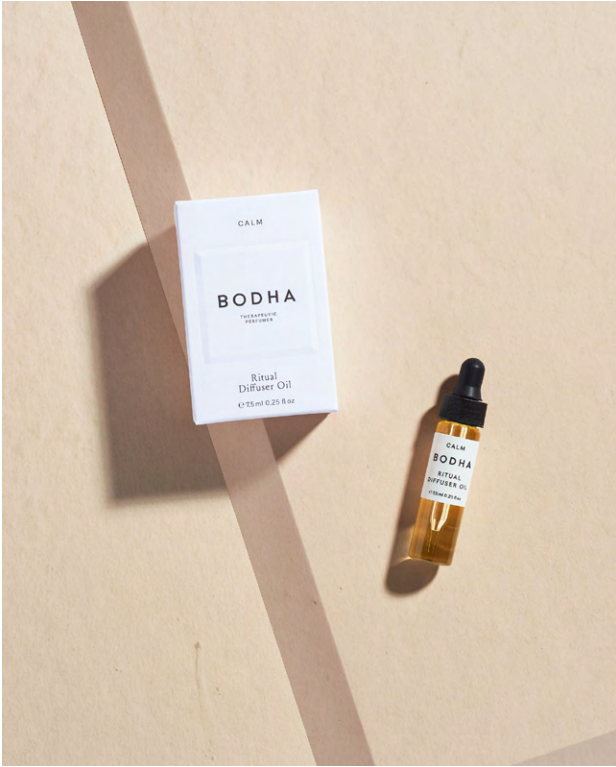
A5a — Calm