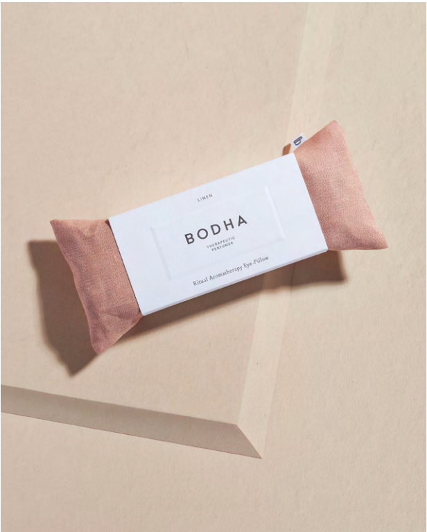
A1d — Blush