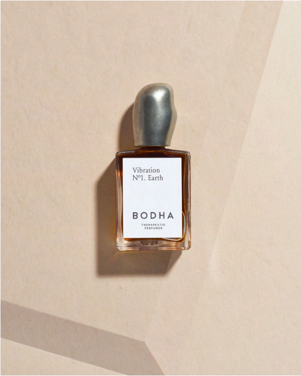
A6a Vibration N°1 Earth