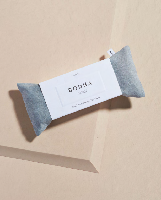
A1c — New Moon