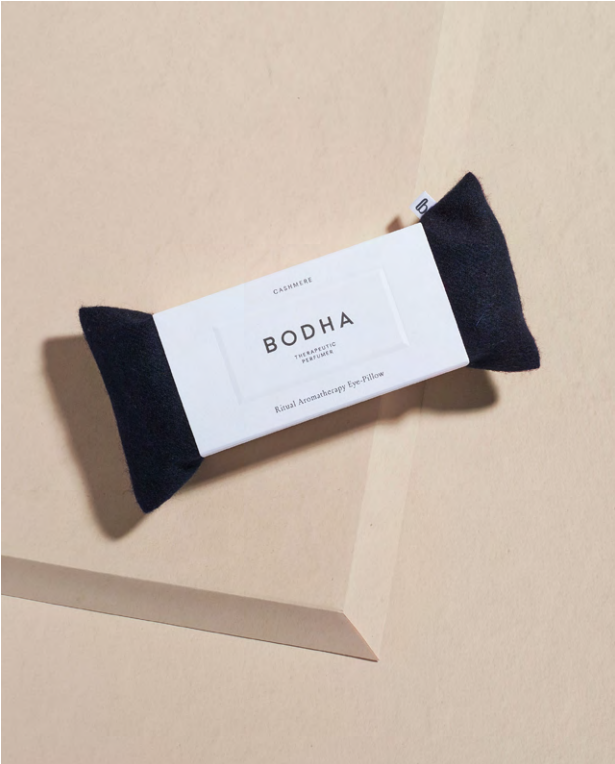
A1g — Navy Cashmere