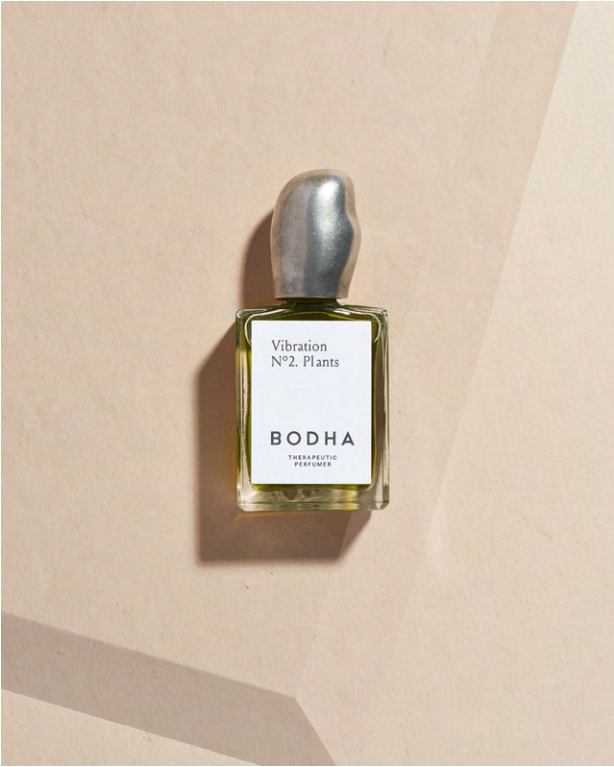
A6b Vibration N°2 Plants