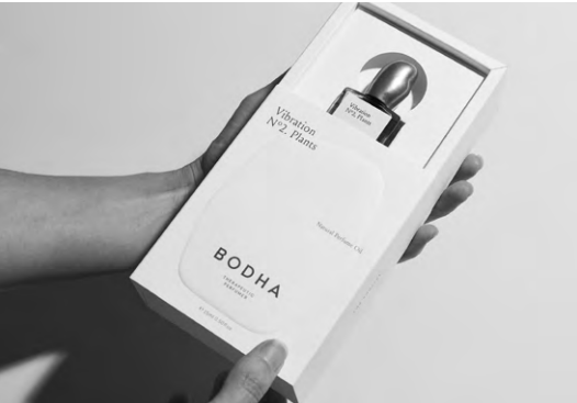
Opening Vibration N°2 Plants