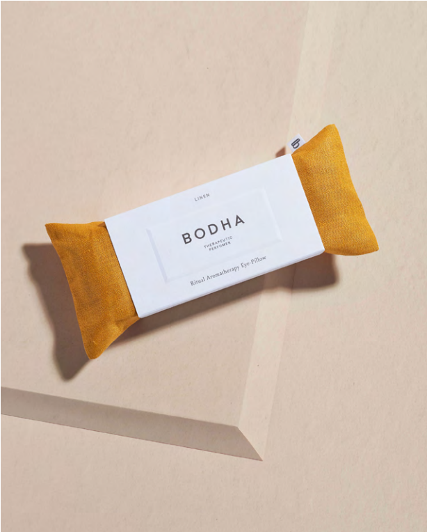
A1b — Gold