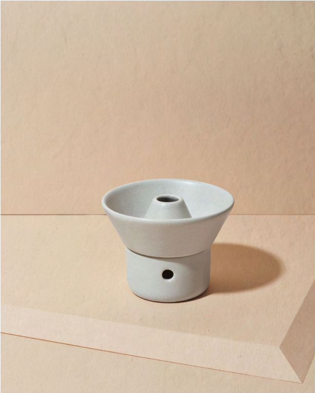
A4c — Cloud Grey